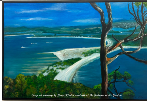
Large oil painting by Saira Riddon available at the Galleries in the Gardens