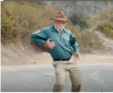
To enjoy the catching song 'Cause I'm happy', click here .