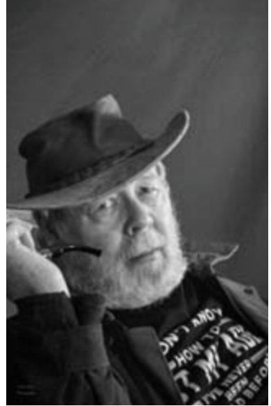
The photographers had a very interesting time learning these

techniques. For more information on the Photography Group click here.